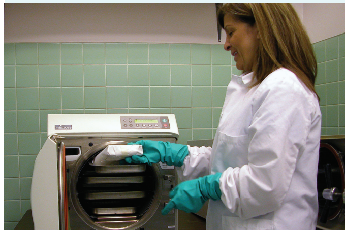
Monitor Every Load

ProChek S is a Class 4 multi-parameter internal chemical integrator strip for use as an immediate result sterilization monitor inside peel pouches, cassettes and packs.